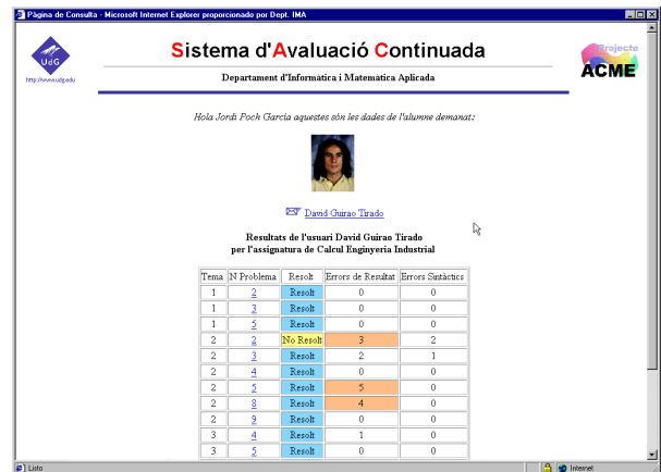
Fig 3. Student page.

Each exercise number is linked to the Exercise page .