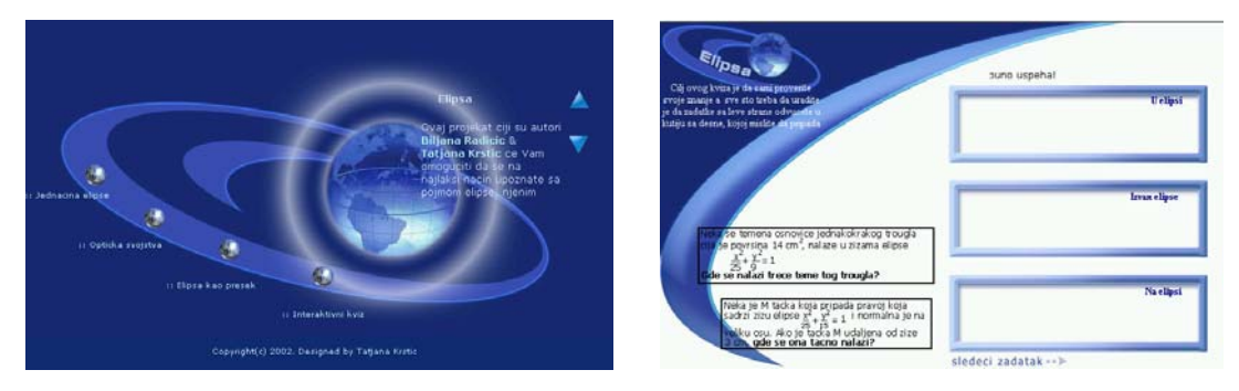
Figure 1. Multimedia ellipse: home page and interactive quiz page

As regards the above listed multimedia project requirements (3)-(6), (3) and (4) were much easier than (5) that was much easier than (6). Requirements (3) and (4) – dealing with the underlying structure and applications of the chosen topic – were more or less implemented in 11 developed artifacts. Some kinds of different learning paths were implemented in 8 artifacts (intuitive and theoretical approaches, two solutions of a task, two ways of introducing a concept). Only 2 artifacts tried to respect the P/C requirement (determining a position using the concept of hyperbola, procedural/conceptual quiz questions). However, having in mind the subjects' experience and relevant prior knowledge as well as the subtlety of the proceduralo-conceptual issues (cf. Haapasalo & Kadijevich 2000, 2003), the project can be considered successful (see Kadijevich 2002). Four screenshots concerning one of the best develop artifacts are presented in Figures 1 and 2.