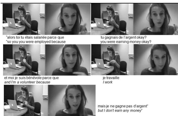
Figure 3: Orchestration of multimodal resources during the lexical explanation of 'bénévole' with webcam and hors-champ views shown